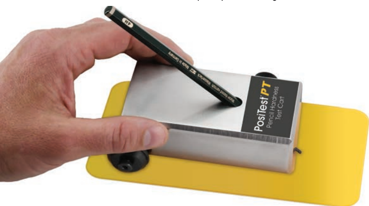
Pencil Cart included with the Complete Kit