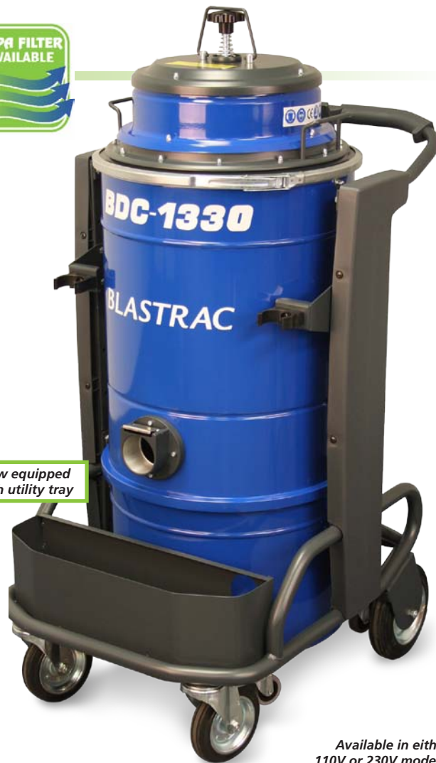
Now equipped with utility tray