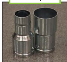
Comes with two hose adaptors