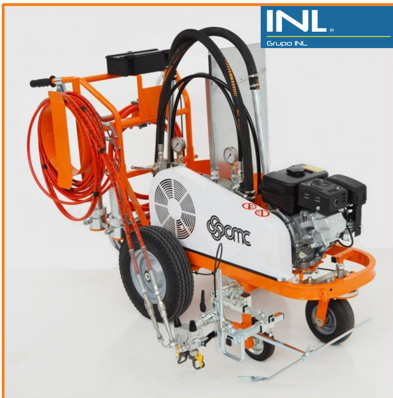
Photo doesn't show standard machine.